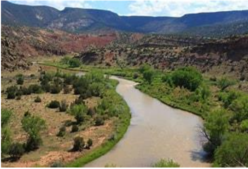
Rio Grande River winds through Rio Arriba County.