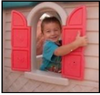
CREATING CARING COMMUNITIES WEBINAR/WORKSHOPS