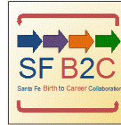
SANTA FE BIRTH TO CAREER COLLABORATIVE NOW ONLINE!